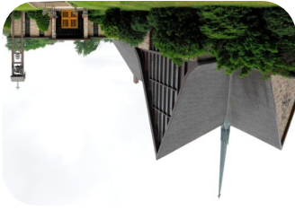
St. Bride's Church

Internet: www.churchofstbride.com Email: info@churchofstbride.com